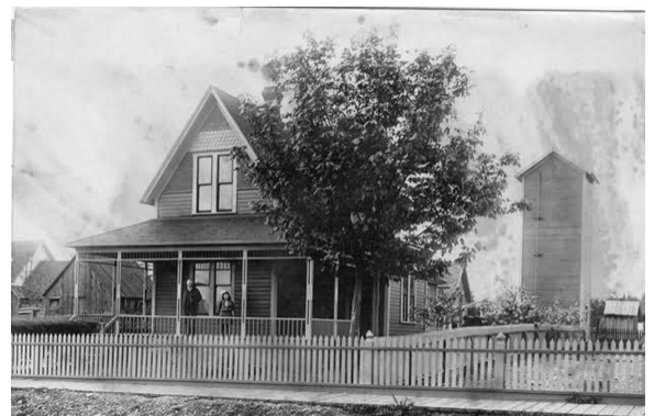
Hannan House on Main Street