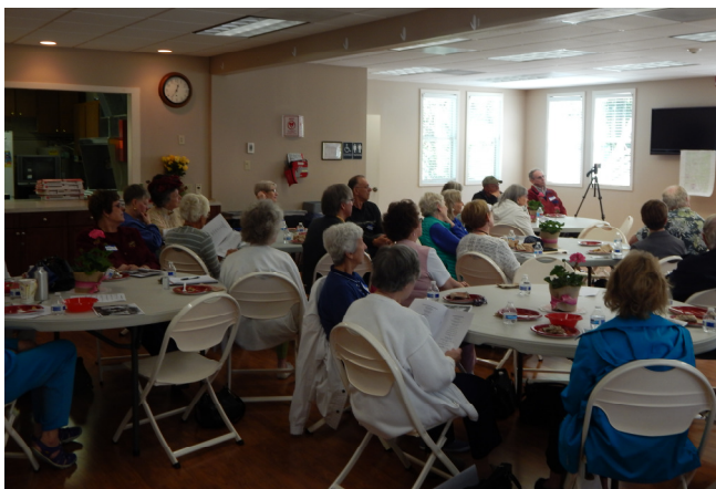
Spring Meeting April 2016