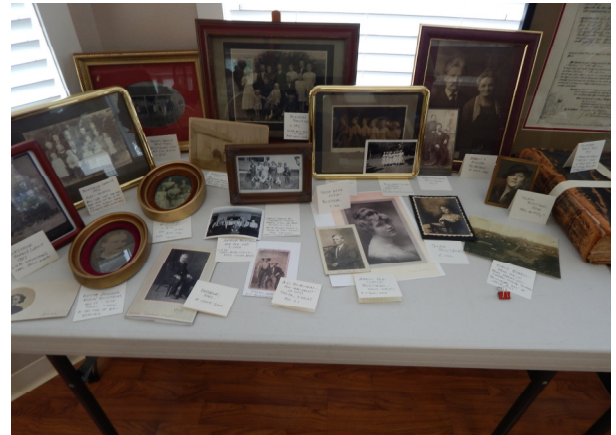
Spring Meeting—Beckstrom Memorabilia