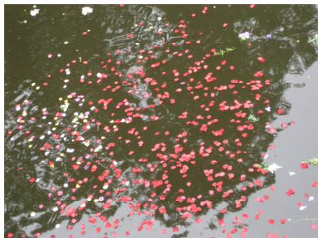
Petals in the River—May 29, 2016