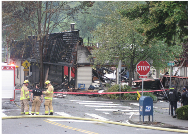
Bothell Fire July 20, 2016