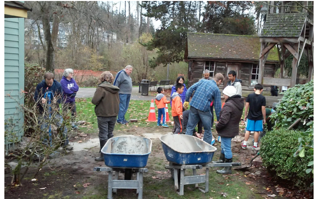
Cub Scout Troup 620 building pathway from Hannan House to the School