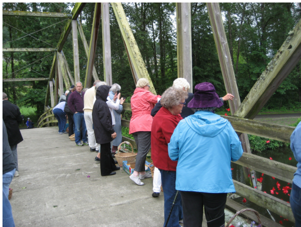
Petals On The River May 29th, 2016